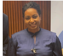
H.E. MENISSA RAMBALLY

Permanent Representative of St. Lucia to the United Nations