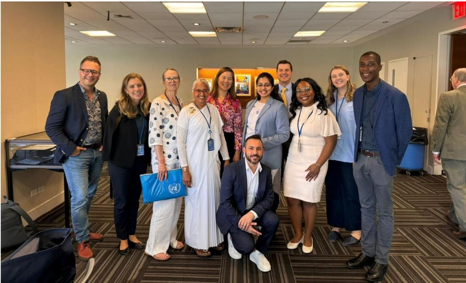
Organizers and participants of the imPACT Coalition side event.

On Friday, September 20th , the ImPACT Coalition on Faith-based Solutions held a Side Event to the Summit of the Future, co-sponsored by the UN Environment Program (UNEP) and the UN Multi-faith Advisory Council (MFAC). A variety of Network members participated in the event including the United Nations Alliance of Civilizations (UNAOC) and the Global Interfaith Network (GIN-SSOGIE.) The side event was a chance for faith actors to share insights, best practices, and actionable recommendations aligned with the Summit's objectives, in support of a more equitable and sustainable future.